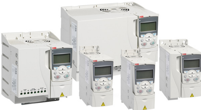
ABB general purpose drives, ACS310, are dedicated to variable torque applications such as booster pumps, level control systems, centrifugal fans, and irrigation systems.