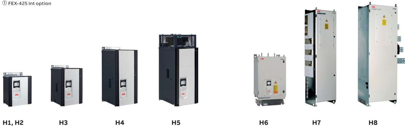
ABB Automation Products GmbH Motors and Drives Wallstadter Straße 59 68526 Ladenburg, Germany

© Copyright 2019 ABB. All rights reserved. Specifications subject to change without notice.