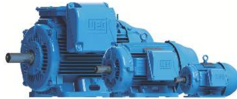
W22 Cast Iron